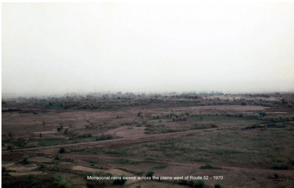
Monsoonal rains sweep across the plains west of Route 52 - 1970